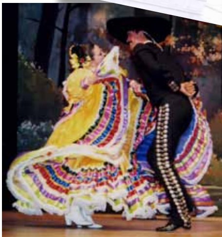
Dancers from Jalisco, Mexico.

Dear Teachers: We hope you will find this CueSheet helpful in preparing your students for what they will experience at the Mariachi Sol de Mexico de José Hernández School Matinee at the Mondavi Center. The CueSheet provides background information on this traditional ensemble and their performance.