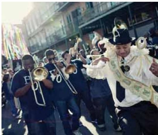
Hot 8 Brass Band leading a second line parade in New Orleans.