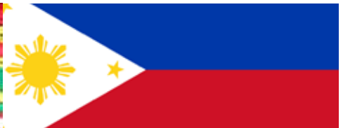
The Philippine flag