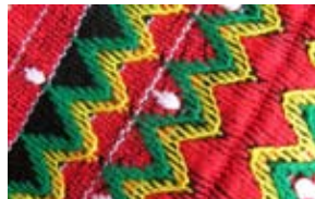
Traditional Philippine fabric