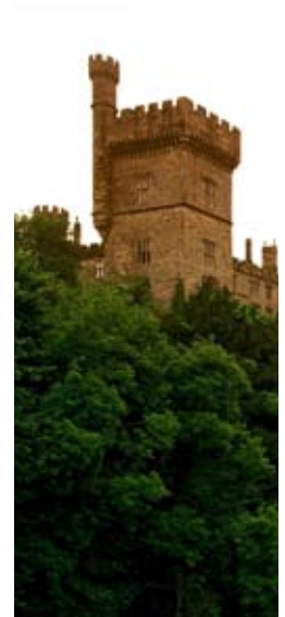
Lismore Castle, County Waterford, Ireland